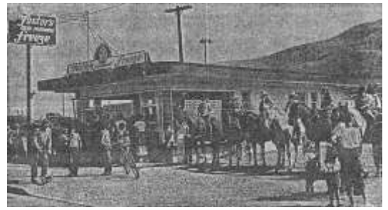
People on horseback were a common sight along San Pablo Dam Road, even into the early 1950s.

In 1951, El Sobrante's original Foster's Freeze opened in a new building at this location in what is now the Park Pharmacy parking lot. Free ice cream was the highlight of its grand opening, and many of the customers that day arrived on horseback. Ernest and Hazel Coryell operated the Foster's franchise here until 1958 when they expanded into a new and larger store which they built nearby (see site #7).