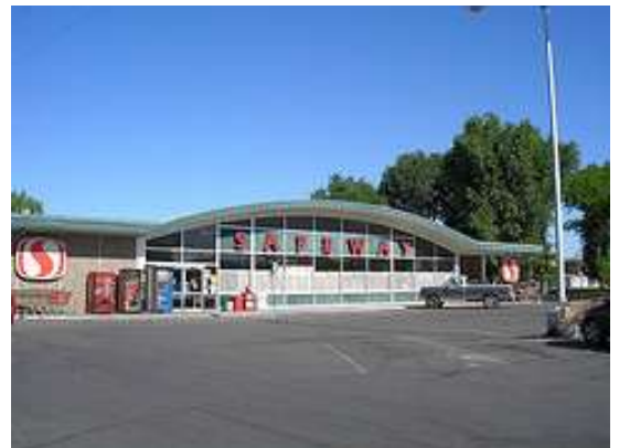
This photo depicts the Safeway store in Lovelock, NV, identical to the former El Sobrante store.

A modern Safeway store was constructed on this site in the late 1950s. Competition in the grocery