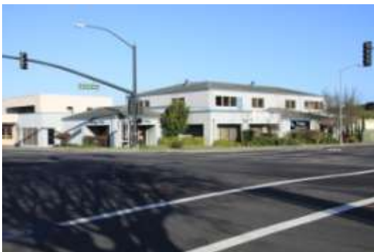
El Sobrante’s only local newspaper, the Herald, was published at this location.