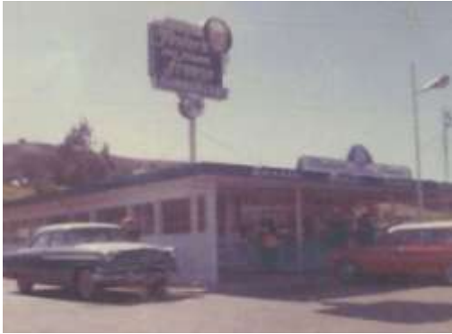
This building, El Sobrante's second Foster's Freeze, will soon reopen as a Subway franchise.