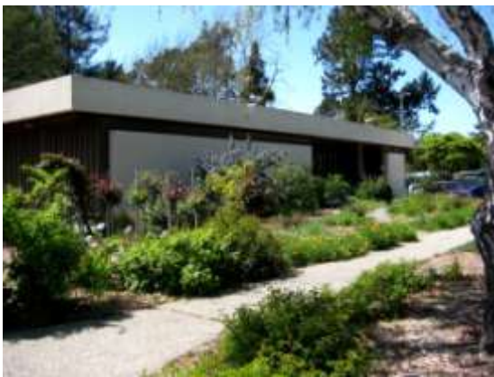
The El Sobrante Library building also serves as the meeting place of several local civic organizations.