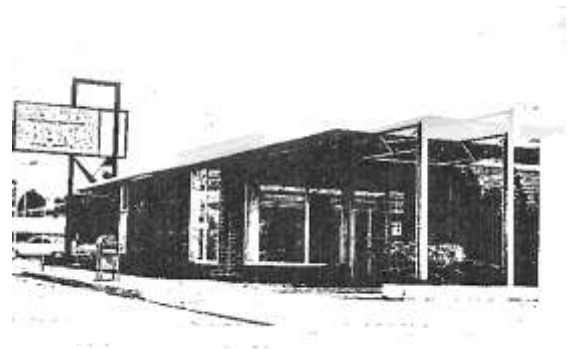
The original Mechanics Bank El Sobrante Branch was classic mid-century modern design.

This building was the Mechanic's Bank's first El Sobrante location. Constructed in 1955, the bank served the local community from this location until 1976, when they opened the new and larger facility just a few doors south, its current location. Beyond the building's faux roof facade and splashy wall graphics stands a fine example of mid-century modern design, a recognized architectural genre rooted in southern California and enthusiastically preserved in communities across the country.