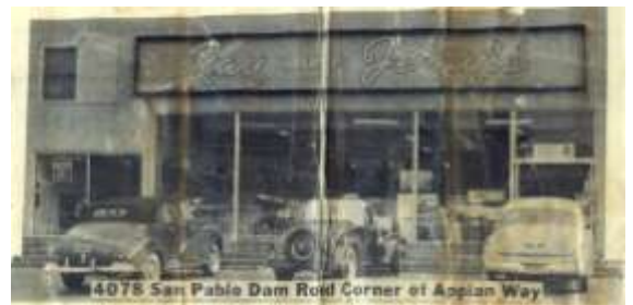
Ray & Jerry’s Market, prior to it becoming store No. 1 of the Fry’s Food Store’s chain. Circa. 1952