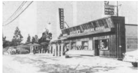
Oliver’s Chevron circa 1950...and remodeled façade circa 1952.