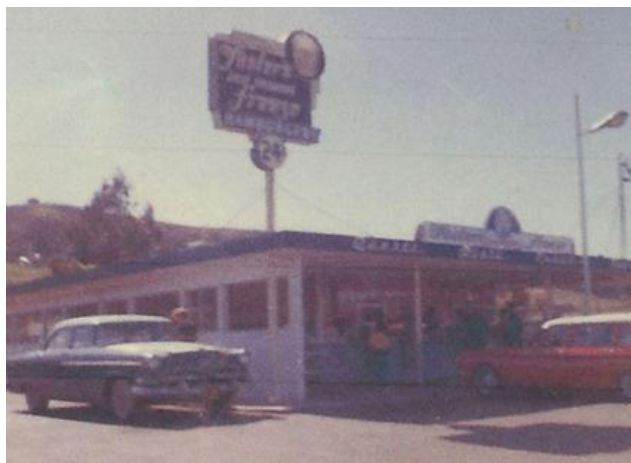
The new and larger Foster's Freeze opened around 1958 next to the Mechanics Bank building. Today it is vacant.

A suitable site for a new store was available adjacent to the Mechanics Bank building (now The Peddler bicycle shop). The land was purchased and the Coryell's notified an understanding Mr. Galli they would not be renewing their lease. At the new site a larger and more modern store was constructed. The new store provided a partially enclosed customer eating area and was set back farther from the busy roadway than the original store. This permitted more convenient parking in front and assured that customers would be a safer distance from passing traffic.